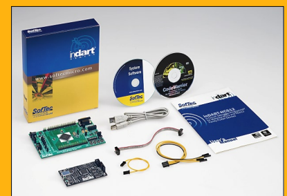
An inDART-HCS12 Design Kit Package